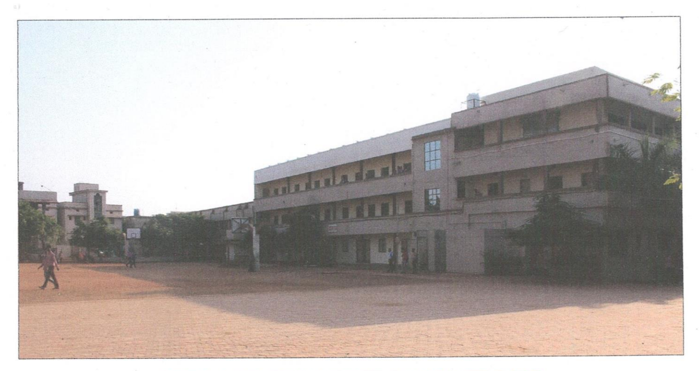
ARTS AND COMMERCE WING BUILDING