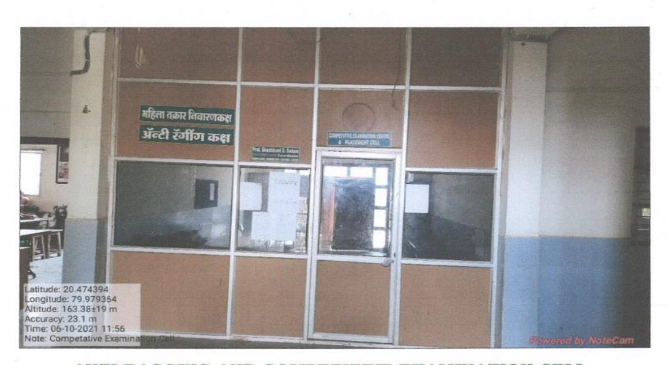
ANTI-RAGGING AND COMPETITIVE EXAMINATION CELL